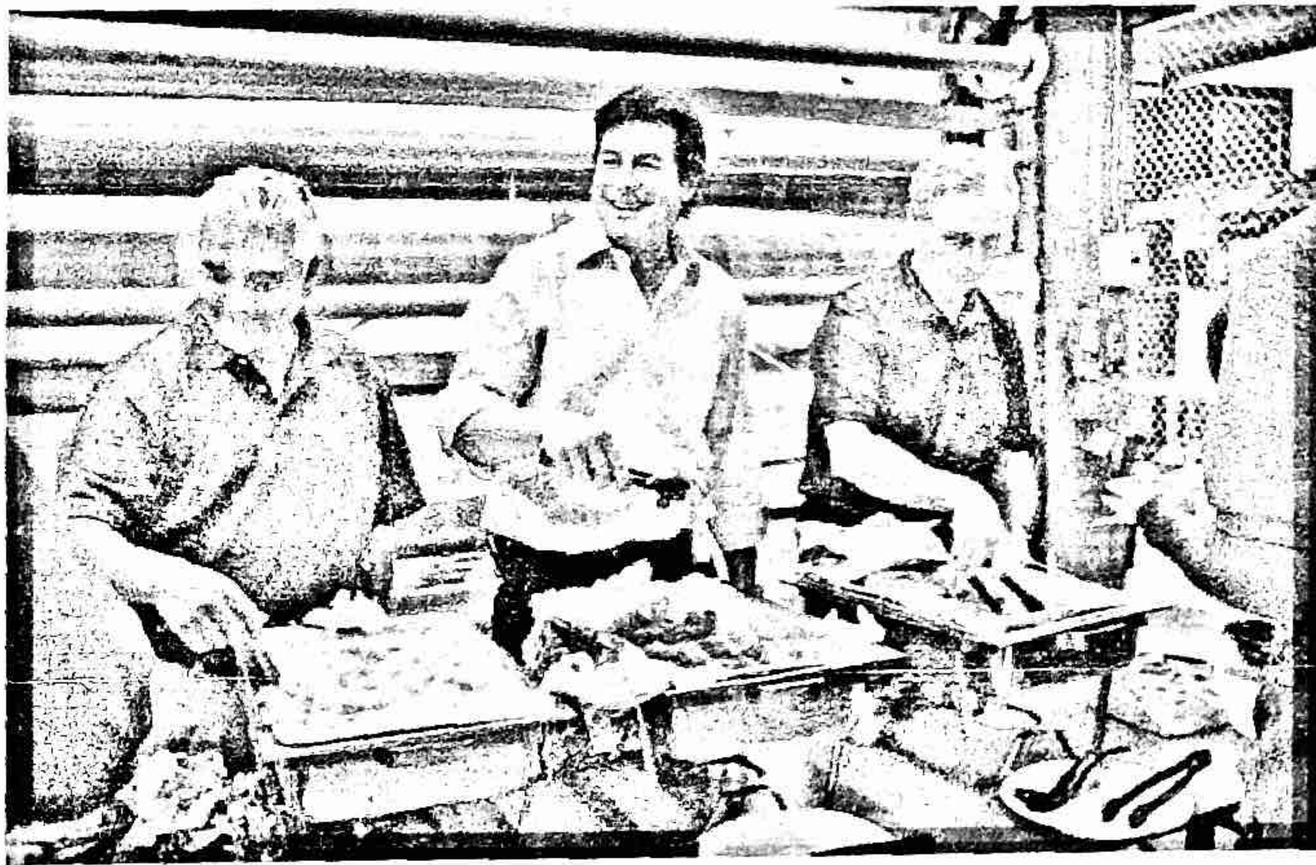
Bonded's team includes many employees with 20+ years of service to our customers.