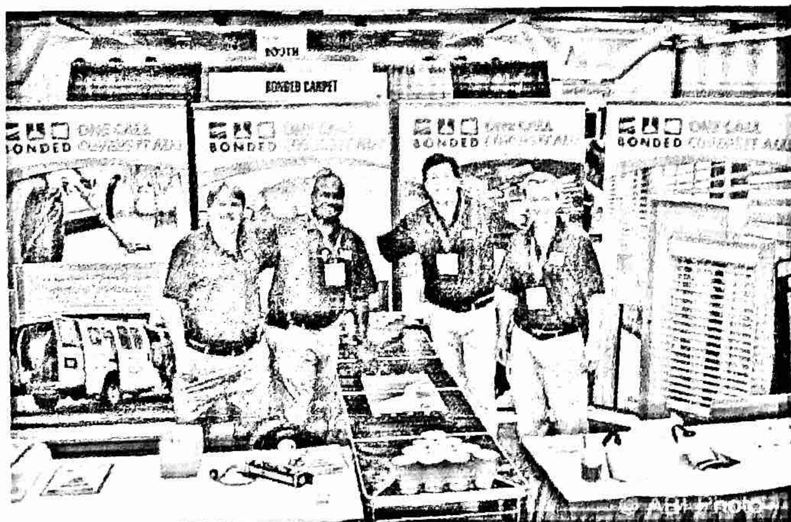
Bonded's leadership team at the A Expo