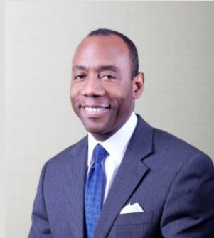
Cornell Brooks, J.D. Former President & CEO, NAACP, Visiting Professor of Social Ethics, Law, and Justice Movements, Boston University School of Law, Visiting Fellow and Director of Campaigns and Advocacy Program, Institute of Politics at Harvard University