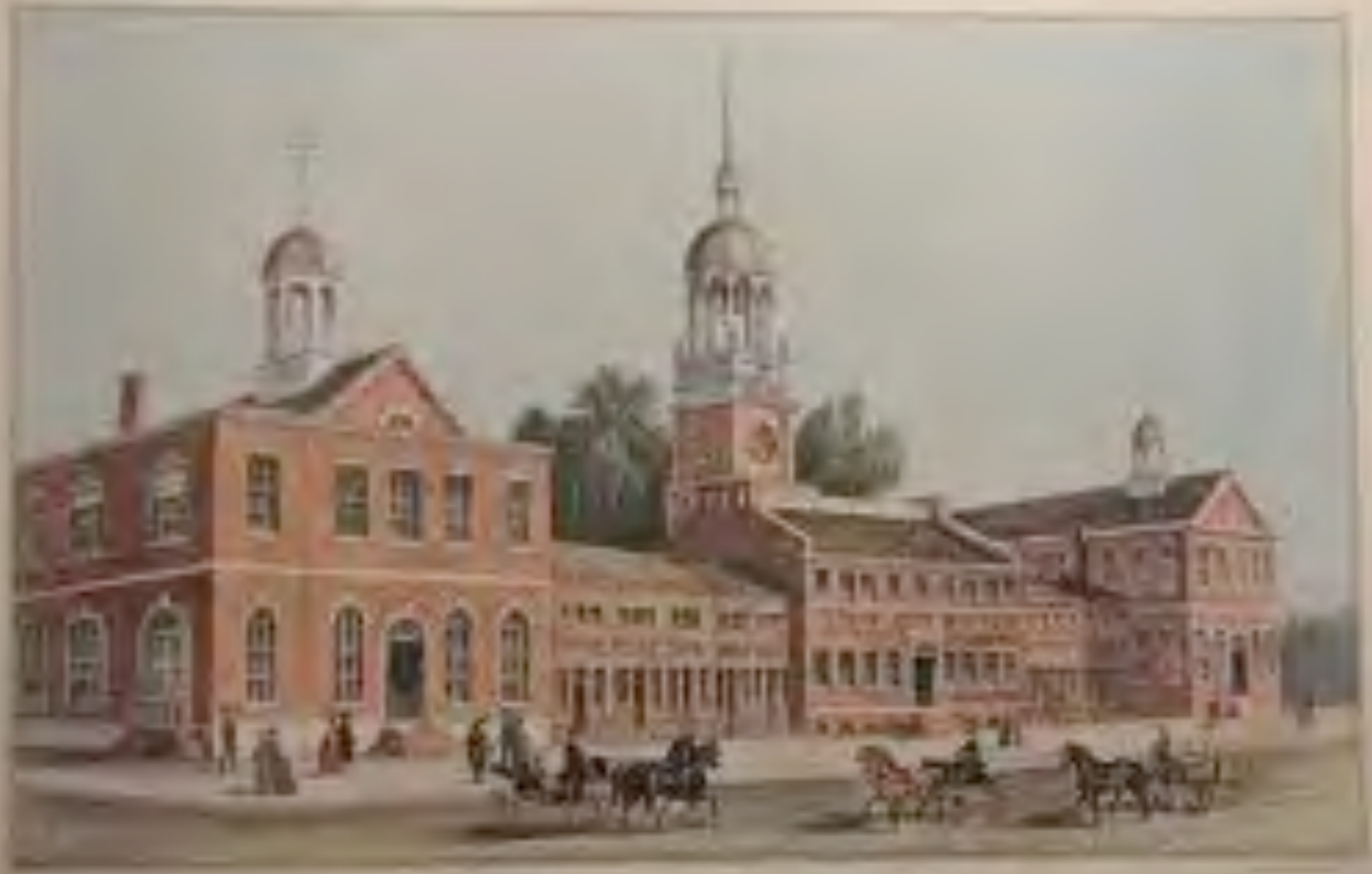
INDEPENDENCE HALL, PHILADELPHIA 1776