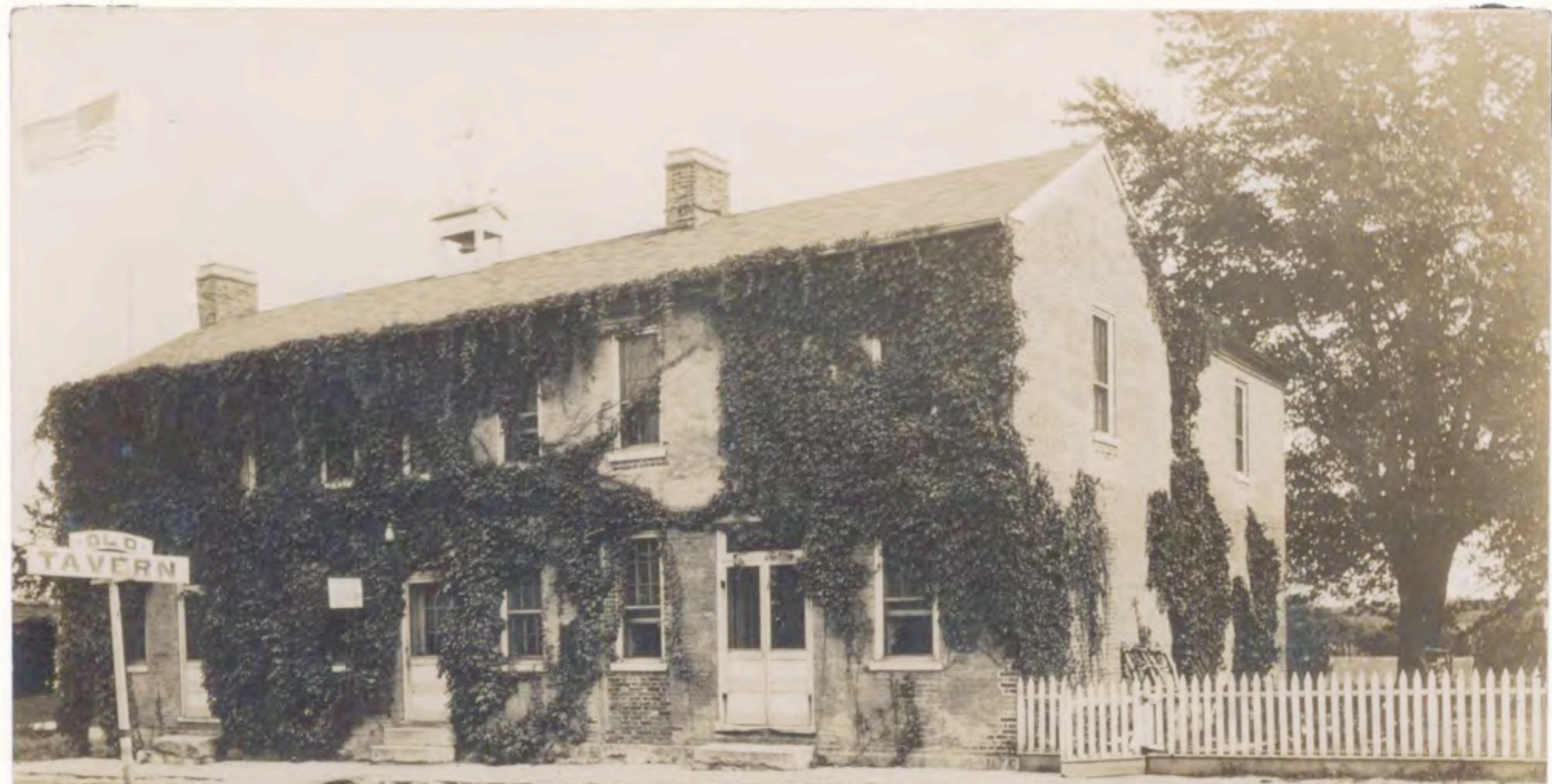
ARROW ROCK TAVERN ARROW ROCK, MO.