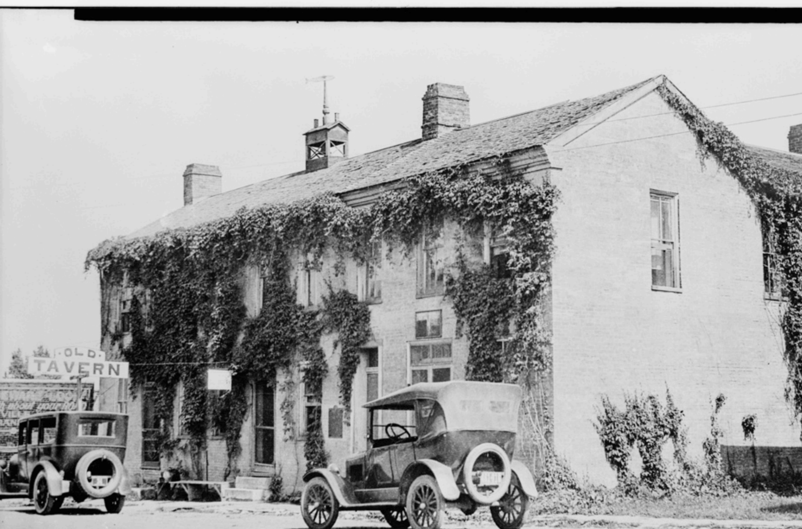
OLD TAVERN, ARROW ROCK, MISSOURI, BEFORE RESTORATION BY D.A.R. 1925