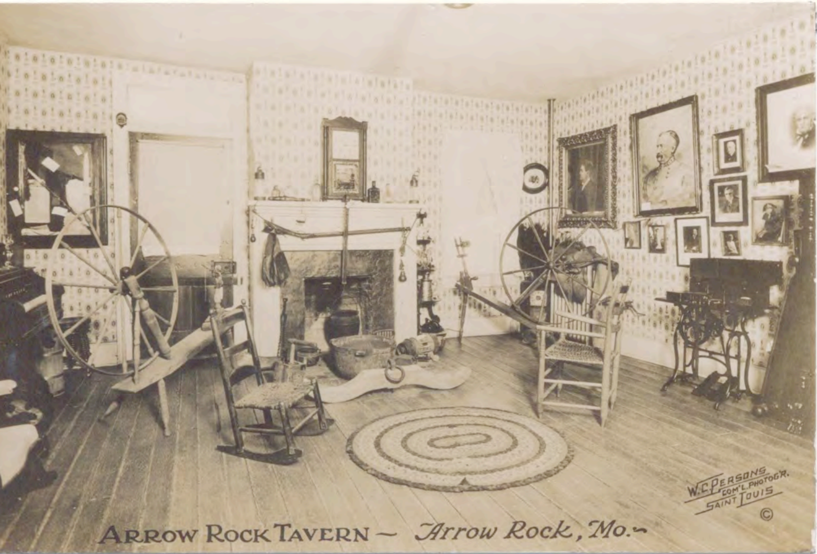
ARROW ROCK TAVERN - Arrow Rock, Mo.